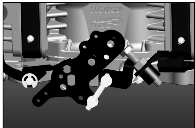
Figure 2 – Near WOT Position