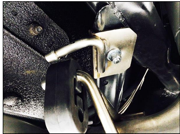
Figure 2 – Right front hanger bracket