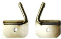
Front over-axle hangers