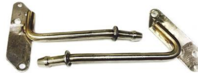
Rear over-axle hangers

Thank you for choosing to install a HOOKER™ exhaust system on your 1978-88 GM A/G-body vehicle. Although these systems have been specifically developed for direct fitment with HOOKER™ LS swap components for these applications, they will provide equally beneficial fitment, function and service life with other non-Hooker LS swap headers or non-LS engine equipped G-bodies through modification of the system inlet tubes, or construction of new ones, by a competent fabricator (use of double-hump crossmember required).