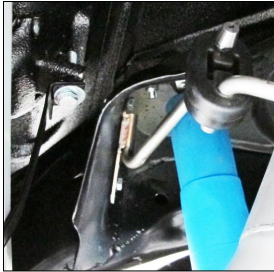
Figure 3 – Rear driver's side hanger (passenger's side hanger is similar)