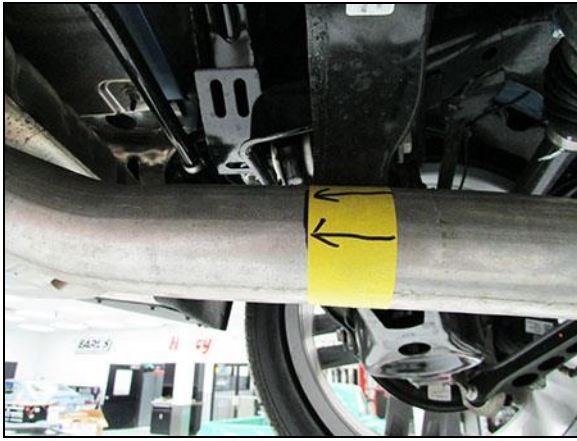
Figure 1 (Left Side)