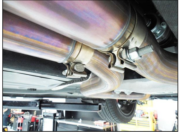
Figure 2 – Down pipe to X-pipe clamps