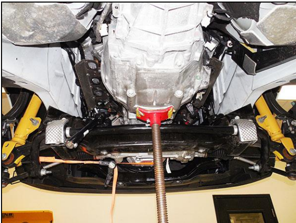
Figure 3 – Engine support and tie strap