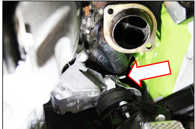
Figure 4 – Engine mount bolts

NOTE: It is normal for your new Blackheart exhaust system to emit smoke for the first few minutes of operation.