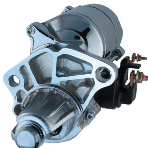
Starter with OE style terminal block

This starter is intended for use on 1964-2003 Chrysler 5.2 & 5.9l, 225, 273, 318, 340, 360, 361, 383, 400, 426 and 440 CID engines with a 12 volt negative ground electrical system.