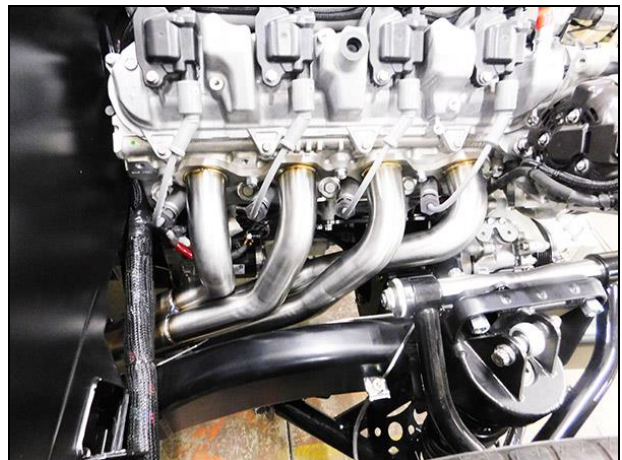
Right header installed