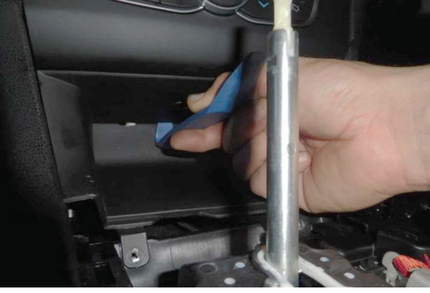
NOTE: Challenger models do not require this step.

12. Pull straight back on upper part of storage tray to release clips. Remove tray from console.