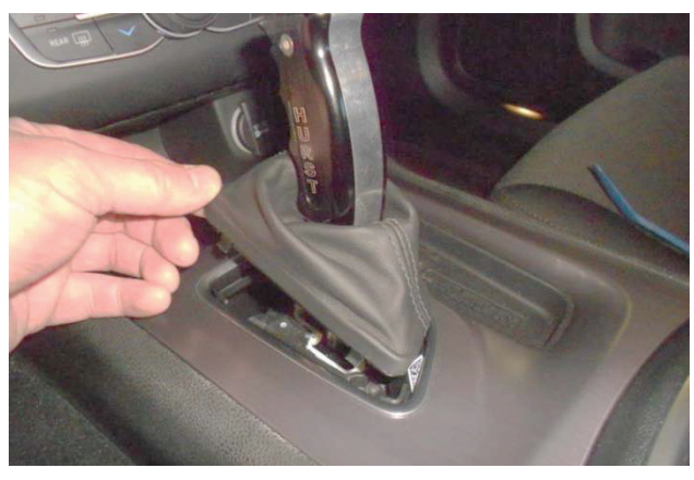
21. Clip shifter boot back into bezel. Shift through all positions to ensure proper installation.