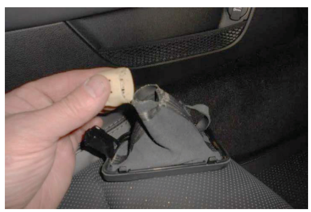
10. The shift boot collar is attached to shift boot with glue. Separate collar from boot, being cautious not to tear boot.