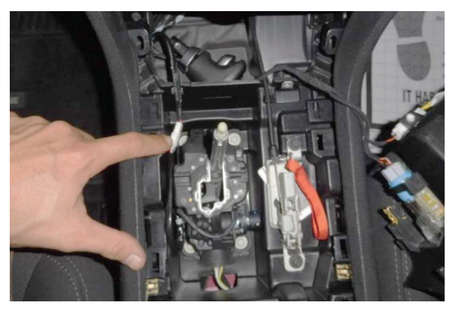
14. Route harness to driver side of shifter housing. Place stock handle into empty space in front of shifter housing under tray (removed step 11). Challenger models have an empty space just forward of shifter housing.