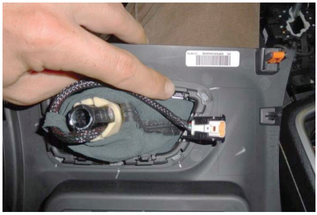
6. Release clips (x4) to remove shift boot and factory handle from bezel.