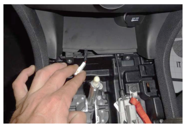
NOTE: Challenger models do not require this step.

15. Reinstall lower tray, ensuring wire harness is routed through opening shown.