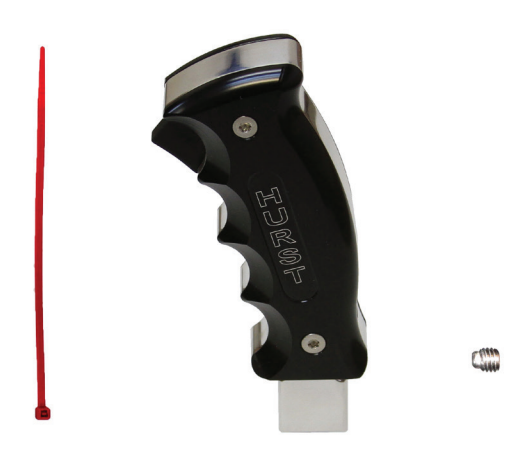
Please take a moment to read and understand these instructions before installing your Flowmaster performance system.

NOTE: Please inventory all parts before starting the installation process and call our tech line to report any missing parts. This will help avoid potentially stranding your vehicle until any missing replacement parts arrive.