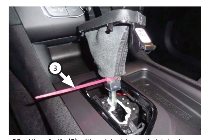
20. Align zip tie (3) with notch at base of pistol grip. Tighten zip tie and trim excess.