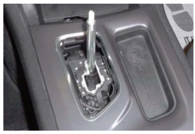
16. Reinstall factory bezel.

15. Reinstall lower tray, ensuring wire harness is routed through opening shown.