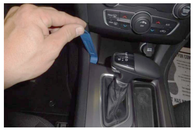
3. Pry up front corners on console bezel then work your way around it to release remaining clips.

2. Remove forward rubber tray from center console.