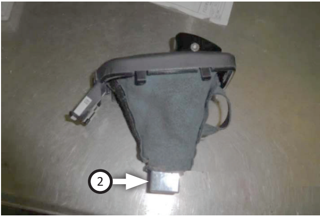
18. Slide boot up pistol grip base as far as it will go. Then apply a small drop of thread locking fluid to set screw (2) threads and start it in pistol grip.