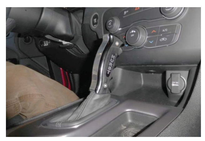
Congratulations, the installation of your Hurst Pistol Grip Handle is now complete!