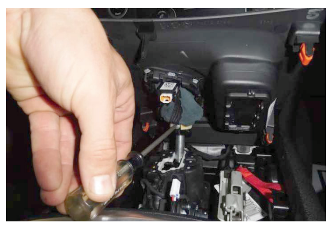
Remove factory set screw located at base of shift handle. Pull straight up on shift handle to remove handle and bezel assembly.