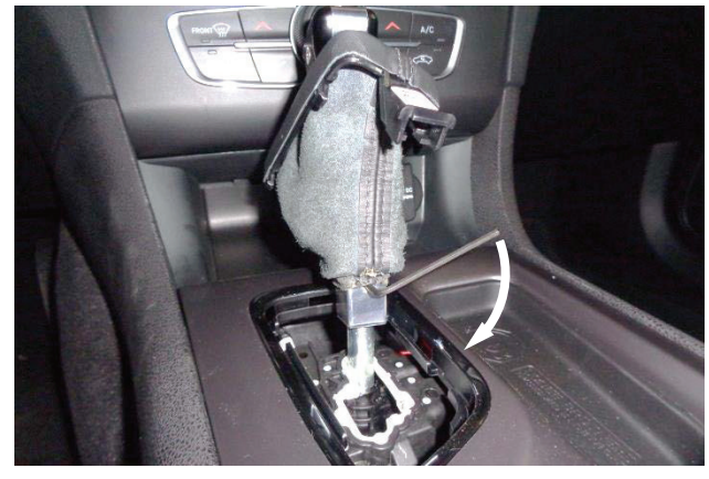
19. Slide pistol grip about halfway down shift rod. Run set screw in until it bears lightly on shift rod. This assists in aligning set screw with dimple on shift rod. After it is aligned, tighten screw fully.