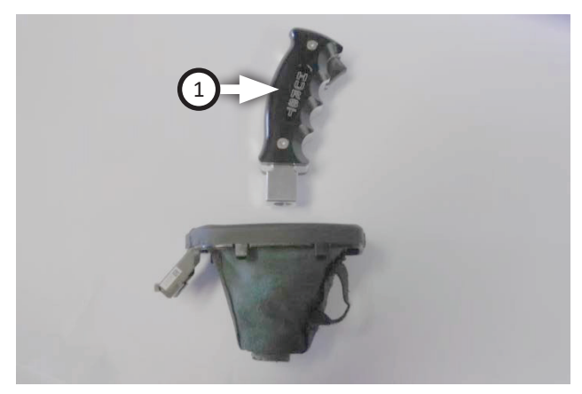
17. With boot inverted, insert pistol grip (1) into boot, orienting it as shown.