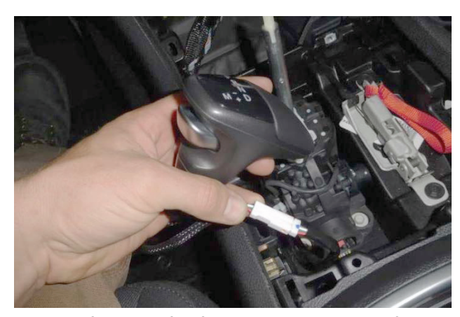
13. The factory shifter features a computer chip for illuminated gear select indicator. If disconnected, the vehicle ECM will not see it and an error light will be generated. To remedy this, plug factory shift handle back into factory connector.

12. Pull straight back on upper part of storage tray to release clips. Remove tray from console.