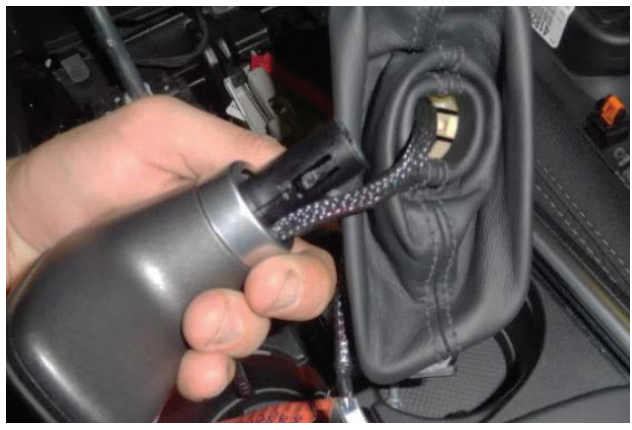
Separate shift boot from shift handle and wire harness.