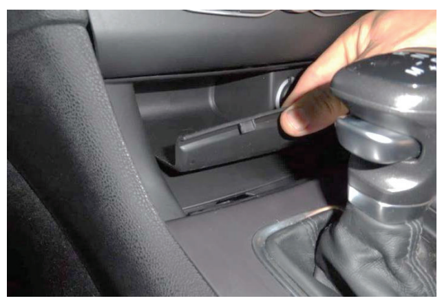
NOTE: Challenger models do not require this step.

2. Remove forward rubber tray from center console.