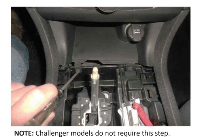
Remove screws (x2) from front console storage tray.