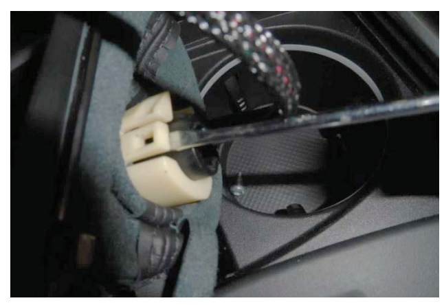
8. Release clips (x2) that mount shift boot retaining collar to shift handle.