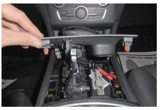
4. Lift up on bezel then unplug shift handle harness connector.