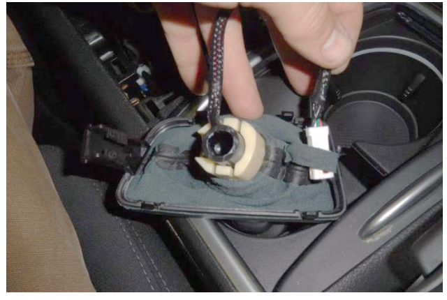
7. Detach shift handle wire harness from mount on shift boot then pull it through boot loop.