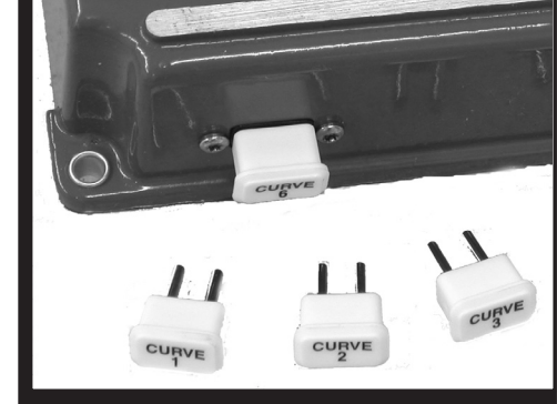
Figure 3 Timing Curve Modules.

Note: Any updates that are made using the PC software will be overridden if a module is left plugged in during power-up of the Controller.