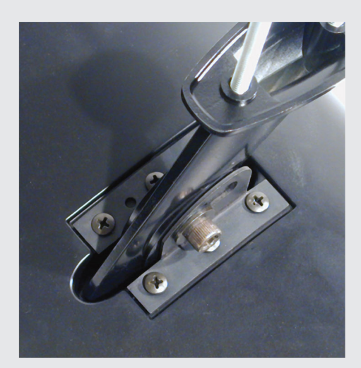
Inside mounting plate