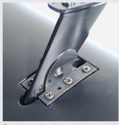
Outside mounting plate