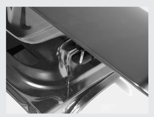
Aligning wing to underside of deck lid