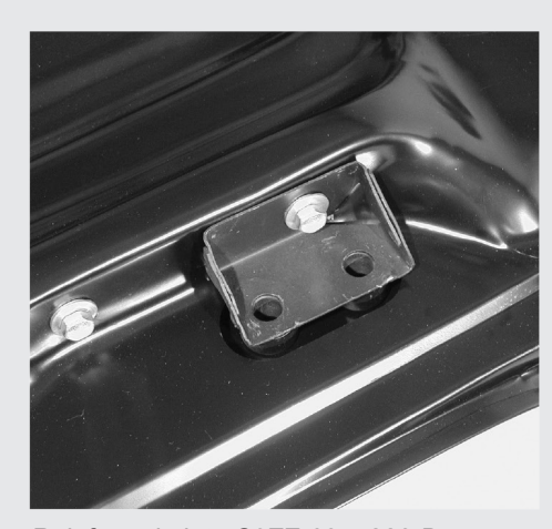
Reinforced plate C9ZZ-6344220-B Not included but sold separately if concours installation required.