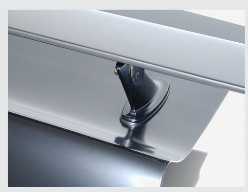
Bolted on and perfectly aligned