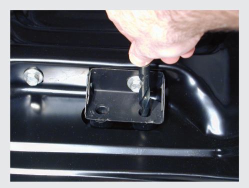
Marking Center with drill bit