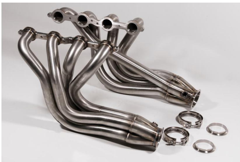
Figure 3 – Detroit Speed Headers

To complete your project and the installation of the engine, Detroit Speed, Inc. has a header package available for this application. The headers are available as P/N: 061001DS. A picture of the headers can be seen below in Figure 3.