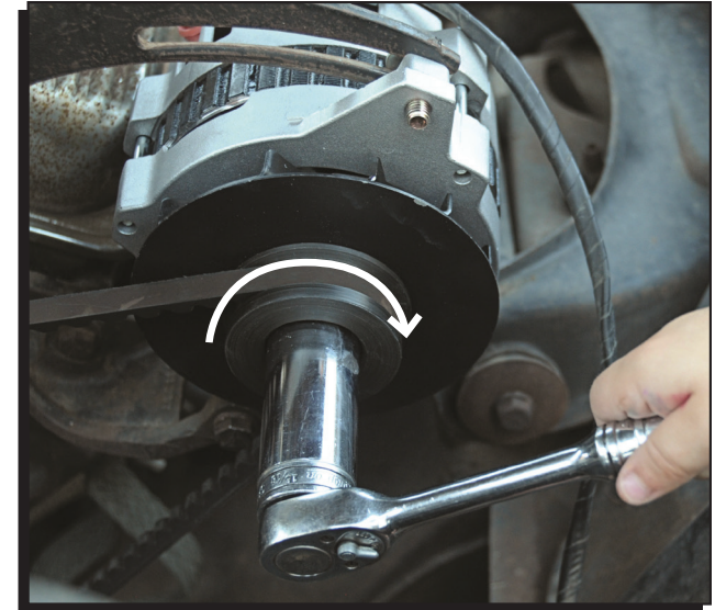
Figure 3 Checking Belt Tension.

CAUTION: Never disconnect the battery when the engine is running. Damage to the alternator will occur.