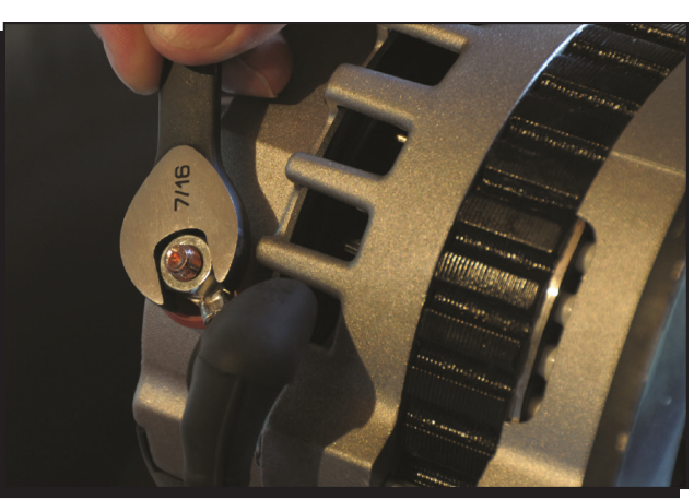
Figure 4 Installing the Charge Wire.