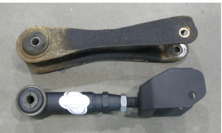
Figure 5 – Determining Arm Length

4. After the bushing is installed, the upper link can be installed. Before installing, adjust the arm to the length of the stock arm that was removed from the vehicle (Figure 5). Place the arm on the vehicle and use the provided 1/2"-20 \times 3.75" L Hex Head Bolts along with the 1/2"-20 Nylock nuts and 1/2" Flat Washers. Do not torque the end link bolts as they will be tightened later with the vehicle at ride height.