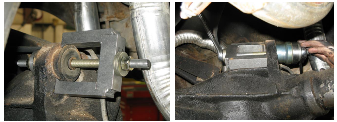
Figure 1 - Bushing removal