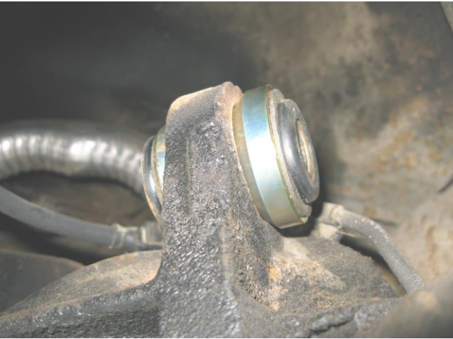
Figure 3 – Replacement Bushing Installed