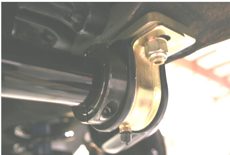
Figure 3 – Split Collar Clamp Installed