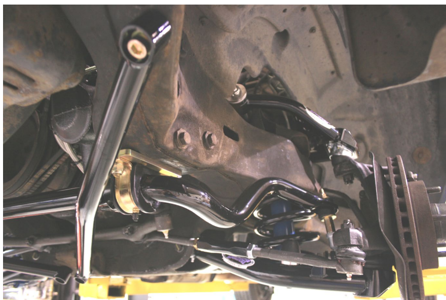
Figure 4 – Completed Installation

If you have any questions before or during the installation of this product please contact Detroit Speed Inc. at info@detroitsspeed.com or 704.662.3272