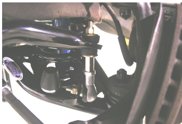
Figure 2 – End Link Installed