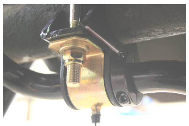
Figure 6 - Split Collar Clamp

6. Separate the Split Lock Collar into two pieces and place around the anti-roll bar to the inside of the anti-roll bar clamps on the rear axle. Reassemble the collar using High Strength Loctite on the bolts and torque to 15 ft-lbs. NOTE : Position the collars tight to the urethane bushing when installing. Figure 6 shows the clamp in place.