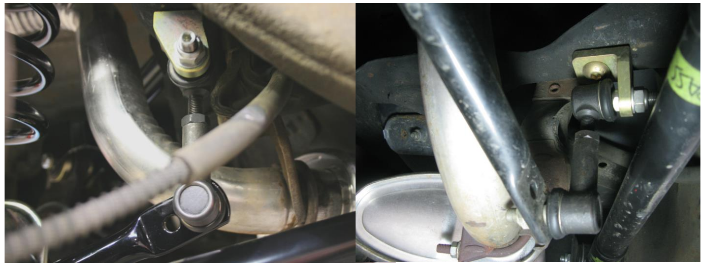
Figure 2 - Upper Mounting Bracket Orientation (Passenger Side Shown)

3. Install the upper link mount brackets on the crossmember. See Figure 2 for reference on the correct placement of the bracket. The mount points to the front of the car and the vertical bend to the outside of the car. Use the provided 3/8" - 24 \times 1 \frac{1}{4} " Hex Head Bolts inserted from the bottom along with the 3/8" - 24 Nyloc Nut and 3/8" AN washer. Torque these bolts to 35 ft-lbs.