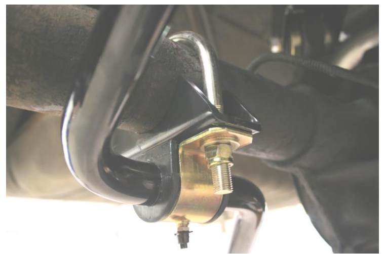
Figure 4 - Anti-Roll Bar Mounted on Rear Axle

To verify positioning of the anti-roll bar mounts on the rear axle, make sure the mounts are as close to the 90° bends on the anti-roll bar as possible. Refer to Figure 4. After installation, lubricate the bushings with a quality chassis grease.