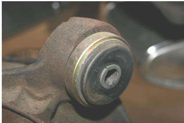
Figure 5 - Replacement Bushing Installed