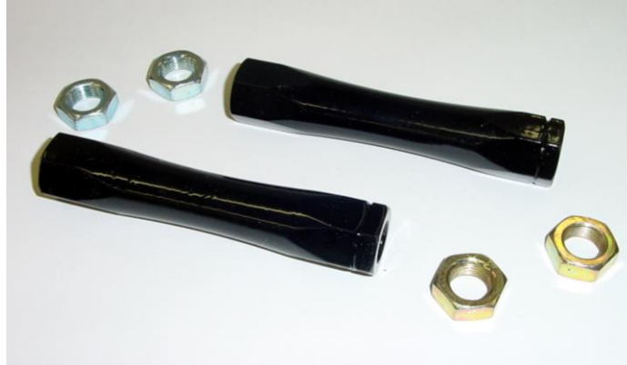
Figure 2 – Billet Tie Rod Adjusters