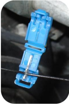
Figure 3 (T-Tap connector installation)