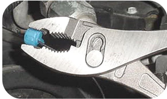
Figure 4 (Close T-Tap connector)

If you have any questions regarding the performance of your kit, call NOS Technical Service at 1-866-464-6553.