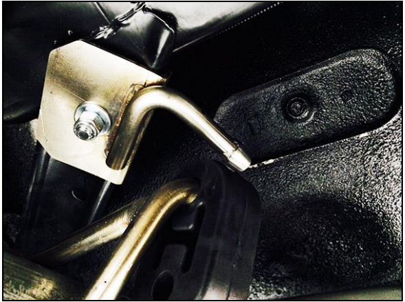
Figure 1 - Left front hanger bracket