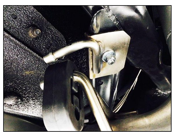
Figure 2 - Right front hanger bracket