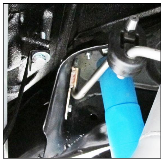
Figure 3 – Rear driver's side hanger (passenger's side hanger is similar)