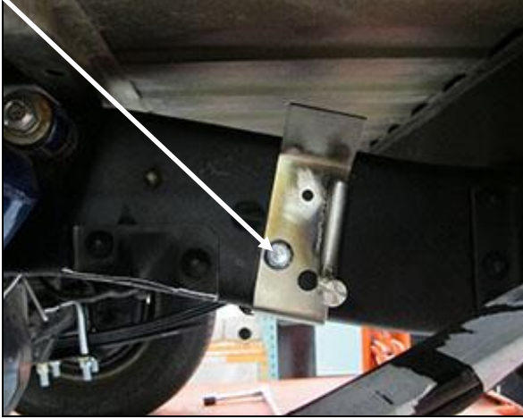
Figure 2 Driver's side tailpipe hanger attachment – use factory hole at arrow point