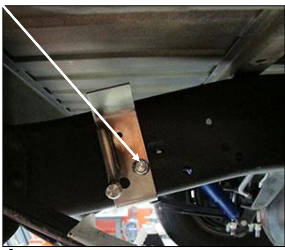
Figure 3 Passenger's side tailpipe hanger attachment – use factory hole at arrow point