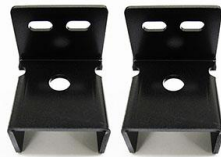
Rear tailpipe hanger (left and right)