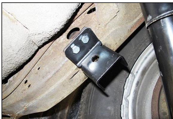
Figure 9 – Left tailpipe hanger bracket