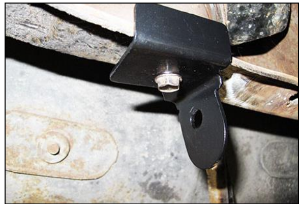
Figure 2 – Right over-axle hanger bracket