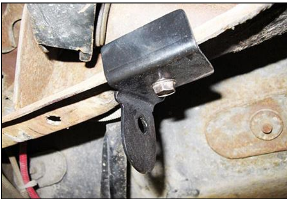
Figure 1 – Left over-axle hanger bracket