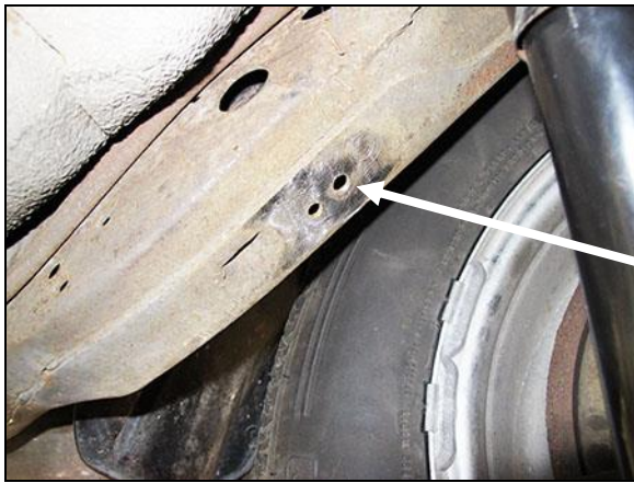
Figure 5 – Left side factory hanger holes

Enlarge these two holes to 3/8" diameter.