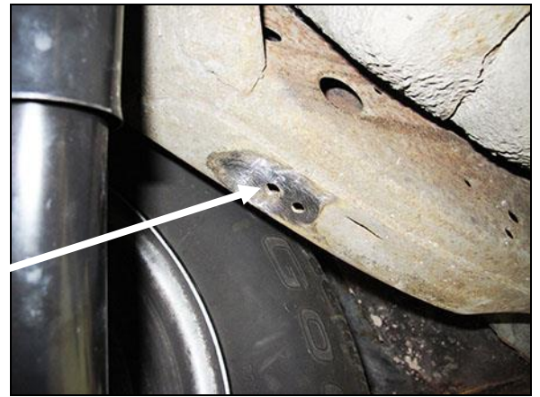
Figure 6 – Right factory hanger holes

Enlarge these two holes to 3/8" diameter.