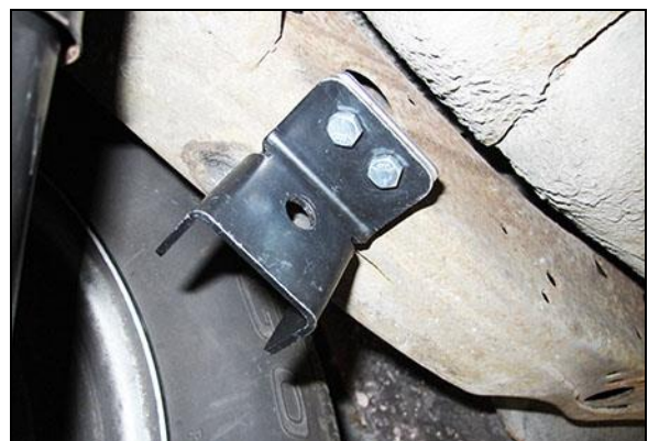
Figure 10 – Right tailpipe hanger bracket