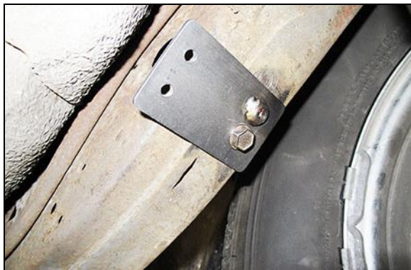
Figure 7 – Left tailpipe hanger bracket