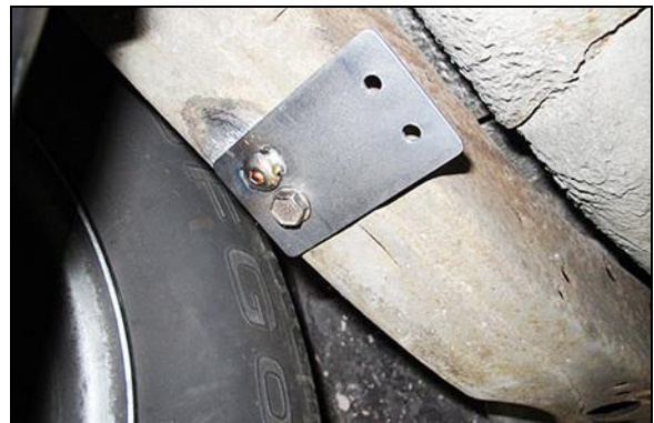
Figure 8 – Right tailpipe hanger bracket