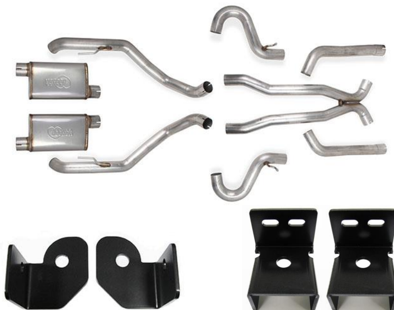
Front over-axle hangers