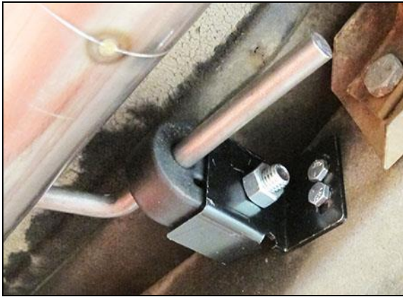
Figure 3 – Left tailpipe hanger bracket