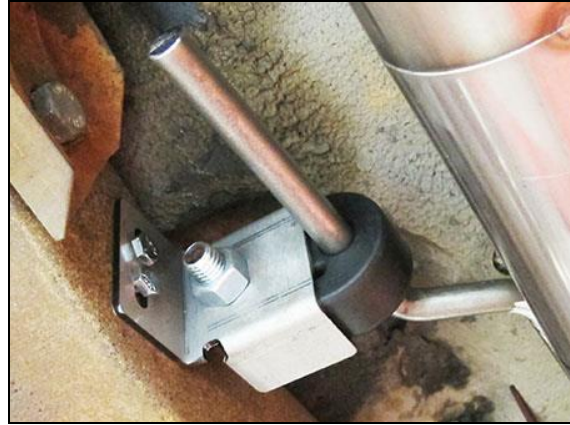
Figure 4 – Right tailpipe hanger bracket