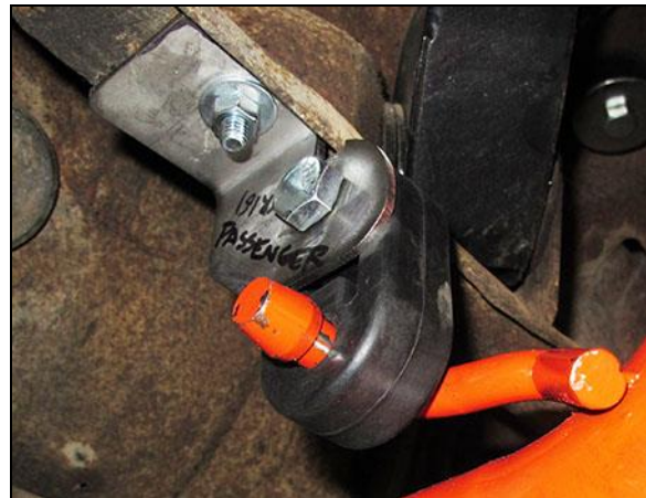
Figure 2 – Right over-axle hanger bracket