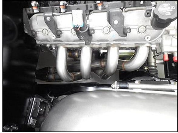
Right header installed