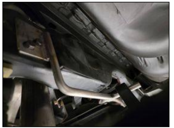
Figure 2 - Right front hanger bracket