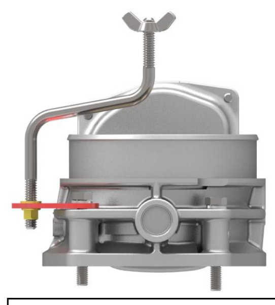
NOTE: The offset mounting plate should install on the left side of your LS3 DBW throttle body. The threaded side of the riv-nut should face down as shown above.