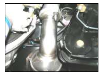
Examples shown - not actual parts