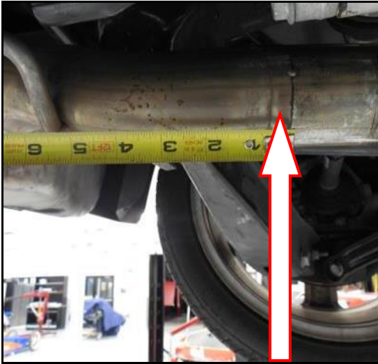
Figure 1 Driver's Side (Cut at arrow – 1/2" forward of clamp mark)

NOTE: Make sure you are at the correct clamp mark – use the differential cover as a reference.