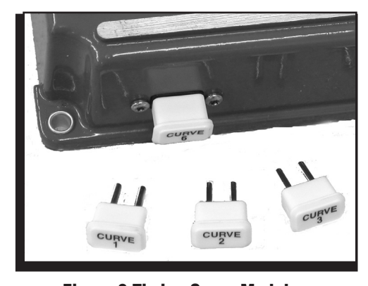
Figure 3 Timing Curve Modules.

Note: Any updates that are made using the PC software will be overridden if a module is left plugged in during power-up of the Controller.