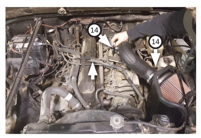
13. Disconnect and remove factory PCV hose from engine. Apply PTFE tape to (x2) male barbs (14) then install them into intake tube.