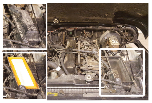
4. Unlatch then remove airbox cover and filter.