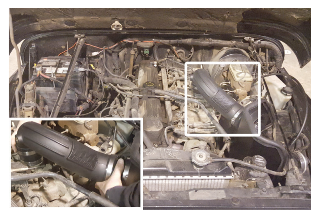
11. Place intake assembly onto throttle body and adapter in engine compartment. Press couplers against stops then center tube. Tighten screw clamps completely.