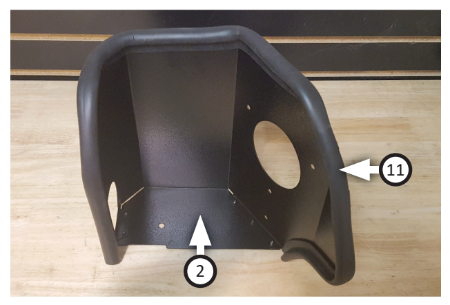
Starting at corner indicated, press airbox gasket (11) gradually around edge of airbox (2) then trim to fit as shown.