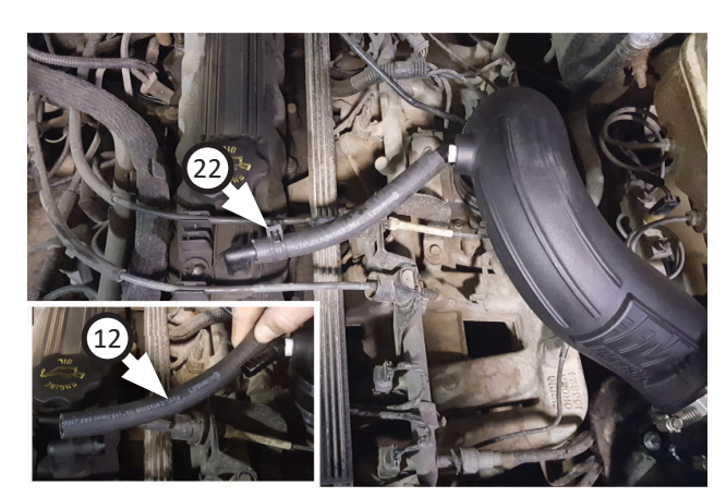
14. Trim to fit fuel hose (12) then connect it between barbs shown, fastening it with hose pinch clamp (22) .