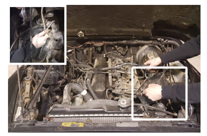
5. Remove airbox from vehicle then remove grommets from holes in base as shown.