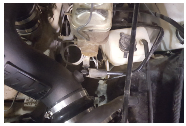
15. Re-connect EVAP hose to barb, seating it firmly as shown.