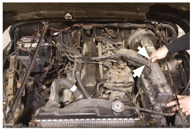
2. Open hood then disconnect EVAP canister and PCV hoses from airbox cover.