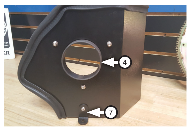
Install bracket (7) with screw (17), flat washer (18), split lock washer (20) and nut (19). Install adapter (4) with (x3 ea.) screws (14), split lock washers (15) and flat washers (16).