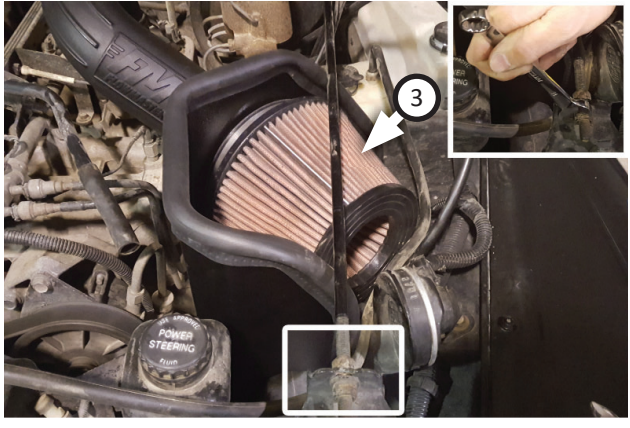
12. Loosen grill support rod nut to allow room for install. Set air filter (3) over air filter adapter in airbox, tighten screw clamp at its base then reinstall rod and nut.