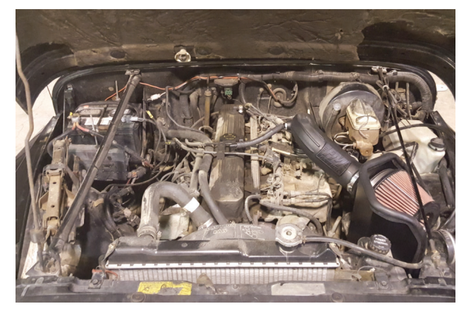
Congratulations, the installation of your Flowmaster Performance Intake system is now complete!