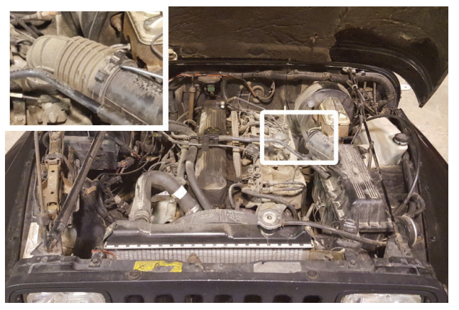
3. Loosen (x2) clamps and remove factory intake tube from vehicle.