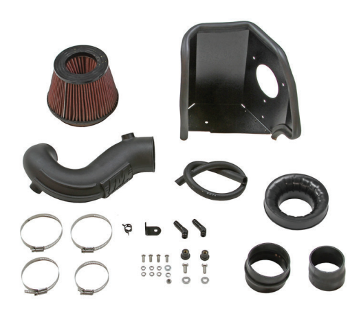
Please take a moment to read and understand these instructions before installing your Flowmaster performance system.

NOTE: Please inventory all parts before starting the installation process and call our tech line to report any missing parts. This will help avoid potentially stranding your vehicle until any missing replacement parts arrive.