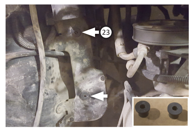
Install (x2) well nuts (23) into airbox mount in engine compartment.