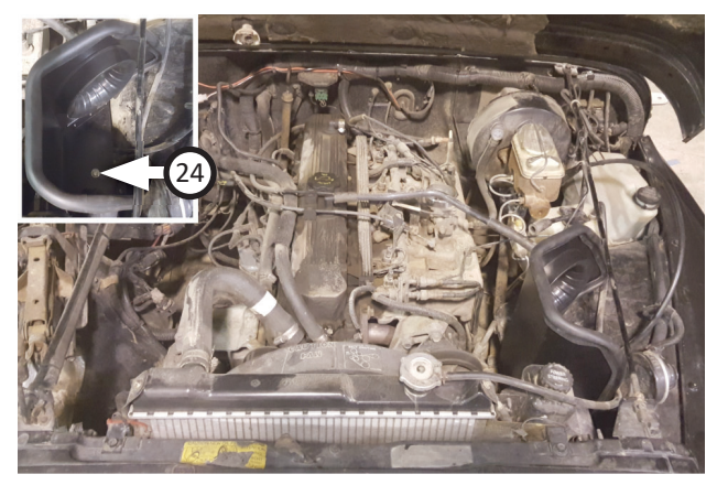
Install airbox into engine compartment, securing it with (x2 ea.) screws (24) and flat washers (21) into well nuts.