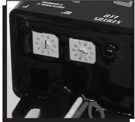
Figure 1 Timing Adjustment.

There are two rotary dials in the Converter that provide adjustment of the timing from TDC to 50° BTDC. The timing is adjustable in one degree increments.