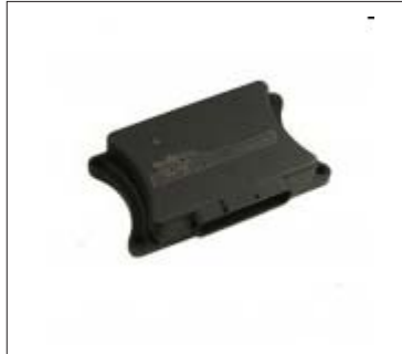
B&M Remote TPS (Must be used with #120001) #120002