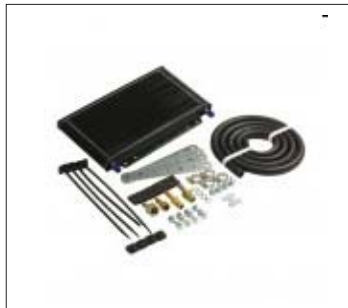
B&M Transmission Oil Cooler #70264 (SuperCooler) #70297 (Hi-Tek Cooler)