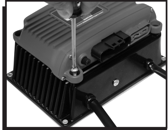
Figure 3 Mounting

The Power Grid System Controller (PN 7730) is designed to be mounted on top of the PN 7720 Ignition. Be sure to mount the Power Grid System Controller so the USB connector and Micro-SD card are accessible. The PN 7730 comes with thread-turning (aka. Self-tapping) screws that will cut into the walls of the pre-drilled holes on the top corners of the Power Grid-7.