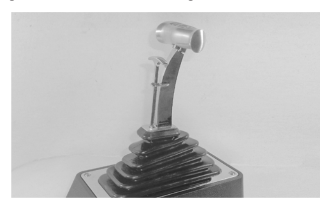
installed and ready to enjoy!