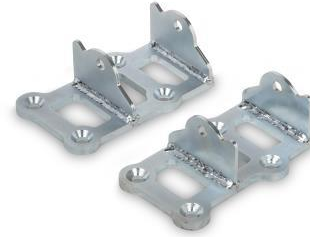
73-87 GM C-10 LS-Swap Engine Mounting Brackets