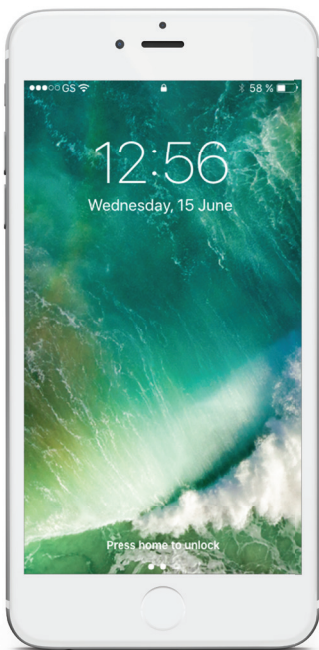
iPhone 6 Pictured