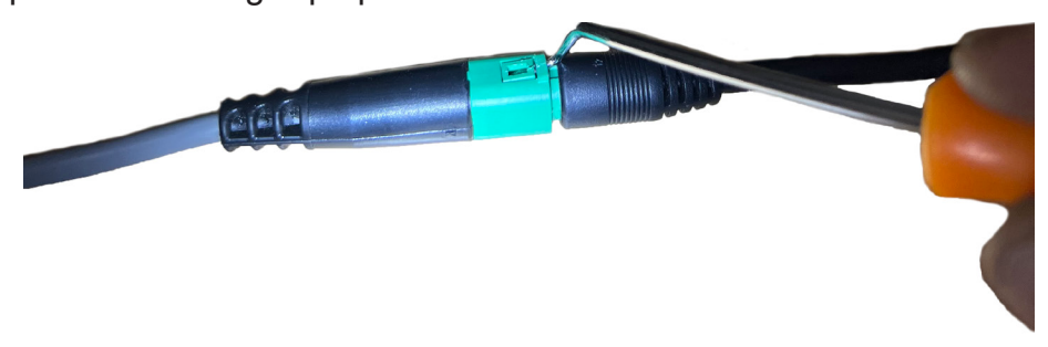
STEP 3 - Pull the connector apart while holding the clip out.