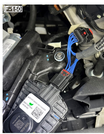
STEP 7 - Connect the OBDII plug into the OBDII port located on the lower left side of the kick panel.