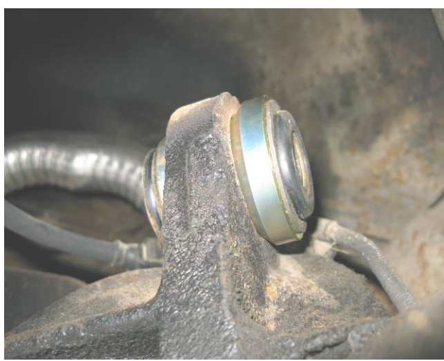
Figure 3 – Replacement Bushing Installed