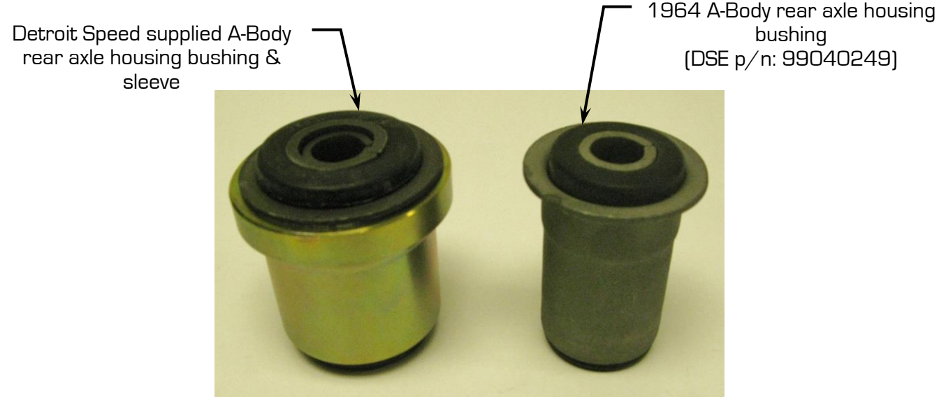
Figure 4 – Rear Axle Bushings

NOTE TO INSTALLER: Do not install the bushing past the large diameter step. The bushing provided in the kit may not fit some 1964 A-Body axle housings due to the overall diameter of the bushing. DSE has a smaller bushing available if the bushing in the kit does not fit your rear axle housing. It is available as DSE p/n: 99040249 (See Figure 4).