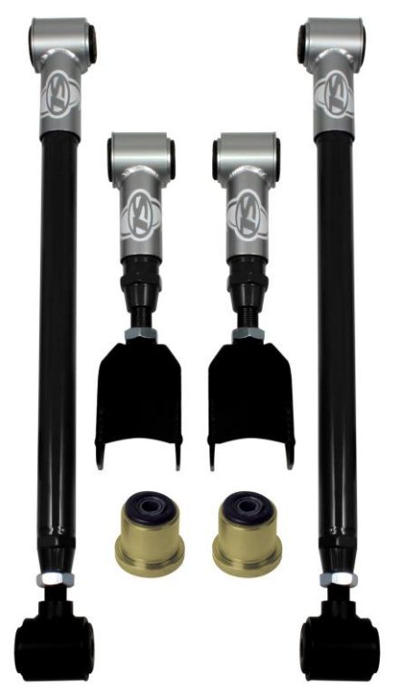
Detroit Speed Swivel-Link™ U.S. Patent Number: 7,398,984

The Detroit Speed Swivel Link<sup>™</sup> Rear Suspension Kit is a terrific way to upgrade the rear suspension on the 1964-72 A-body. Detroit Speed's unique A-body rear trailing links incorporate our patented Swivel-Link system. These unique trailing arms eliminate bind allowing the rear suspension to fully articulate without the use of noisy spherical rod ends. The Swivel-Link Rear Trailing Links allow for easy pinion angle adjustment for improved traction and lower driveline vibrations.