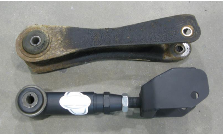
Figure 5 – Determining Arm Length

4. After the bushing is installed, the upper link can be installed. Before installing, adjust the arm to the length of the stock arm that was removed from the vehicle (Figure 5). Place the arm on the vehicle and use the provided 1/2"-20 x 3.75" L Hex Head Bolts along with the 1/2"-20 Nylock nuts and 1/2" Flat Washers. Do not torque the end link bolts as they will be tightened later with the vehicle at ride height.