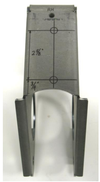
Figure 3 - Bottom of the Coilover Bracket

3. With the centerline marked, measure from the forward most point on the bracket to the rear of the bracket 3/4". This is the centerline of the forward hole in the sway bar mounting clamp. From this point, measure rearward an additional 2-5/8". This is the centerline of the rear mounting hole. At both points, drill a 13/32" hole. NOTE: This is your finish hole size for the provided hardware. Figure 3 shows the bottom of the coilover bracket.