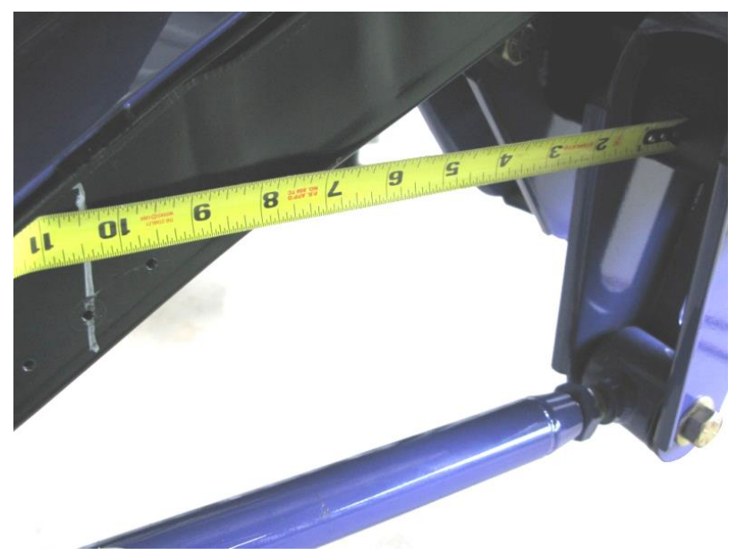
Figure 4 - Measuring for the Sway Bar Mounting Bracket

4. To locate the forward sway bar mounting bracket, measure from the center of the rear axle tube forward 12" at the frame rail. This can be done by first determining the diameter of the rear axle tube, subtract half of that measurement from the 12" and then measure forward from the front side of the axle tube. Based on a 3" axle tube, the measurement used should be 10-1/2". Refer to Figure 4 for reference. Using a level, make a vertical line at the marked location on the framerail.