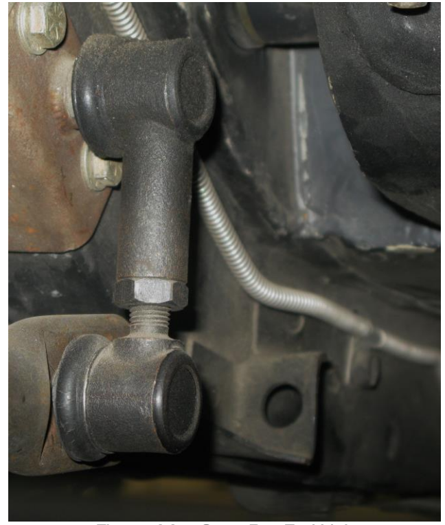
Figure 11 – Sway Bar End Link

16. Before installing the end links into the sway bar, adjust them to a center-to-center measurement of approximately 3-3/8". NOTE: Turn the lower sway bar link so that the threaded stud points to the outside of the vehicle. Tighten the jam nut at this point and connect the sway bar end links to the sway bar as shown in Figure 11.