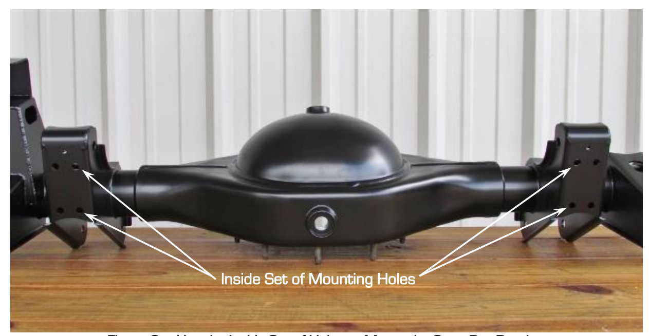
Figure 9 - Use the Inside Set of Holes to Mount the Sway Bar Bracket