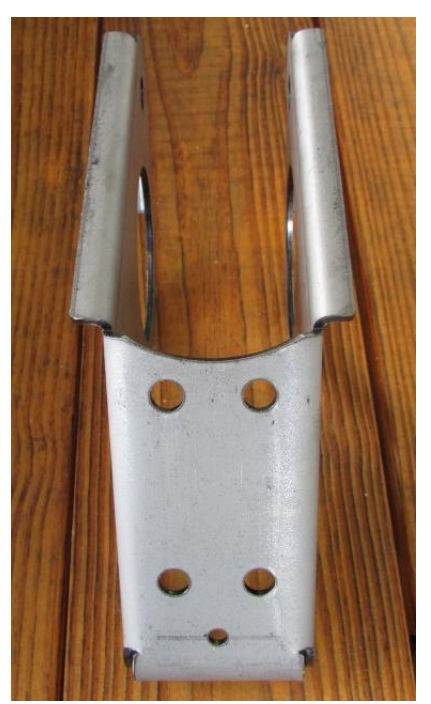
Figure 1 - Pre-Drilled Holes in Coilover Bracket

NOTE: If your QUADRALink lower coilover bracket already has the holes pre-drilled on the bottom side of the bracket (See Figure 1), proceed to step 4. The pre-drilled holes on the lower coilover bracket will not match the ones that have to be drilled in steps 2-3. Both holes layouts will work when mounting the sway bar.