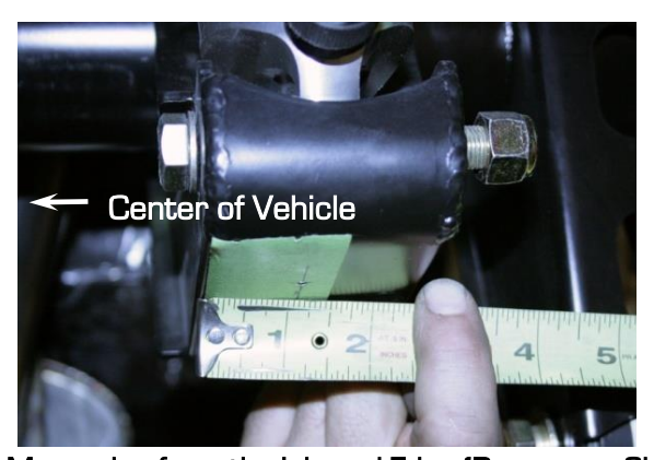
Figure 2 - Measuring from the Inboard Edge (Passenger Side Shown)

2. To locate the sway bar mounting clamps at the rear axle, measure outward 13/16" from the inside edge on the bottom side of the coilover mounting brackets and draw a centerline. See Figure 2.