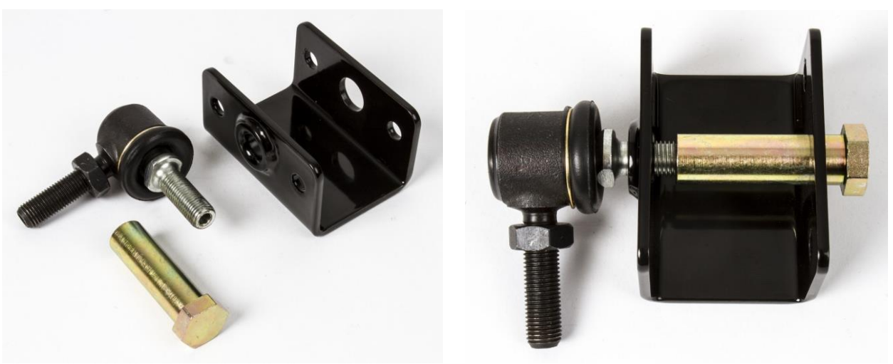
Figure 10 - Sway Bar Mounting Bracket, Upper End Link & Frame Mount Bracket Nut

16. Before installing the end links into the sway bar, adjust them to a center-to-center measurement of approximately 3-3/8". NOTE: Turn the lower sway bar link so that the threaded stud points to the outside of the vehicle. Tighten the jam nut at this point and connect the sway bar end links to the sway bar as shown in Figure 11.