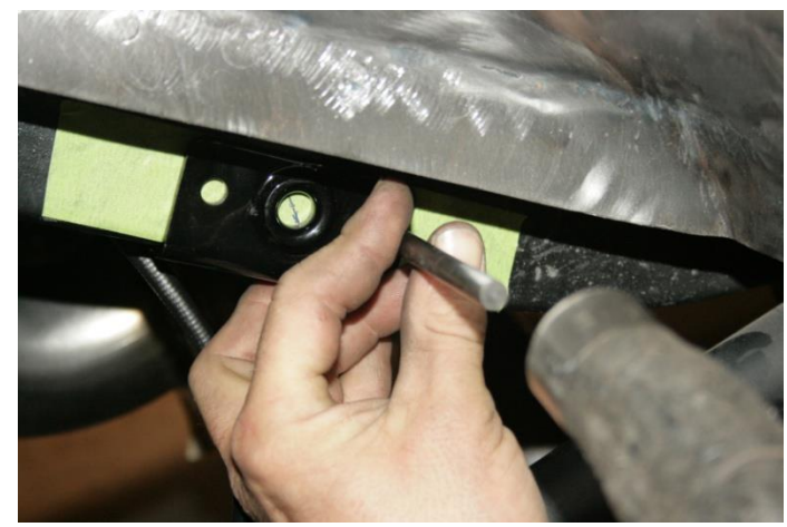
Figures 5a and 5b - Locating the Sway Bar Mounting Bracket Holes on the Frame Rail