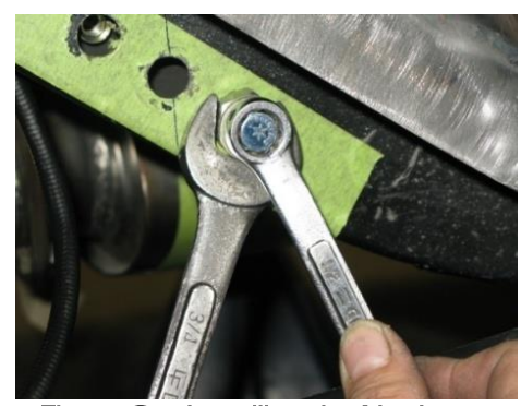
Figure 7 - Nut Insert w/Installation Tool