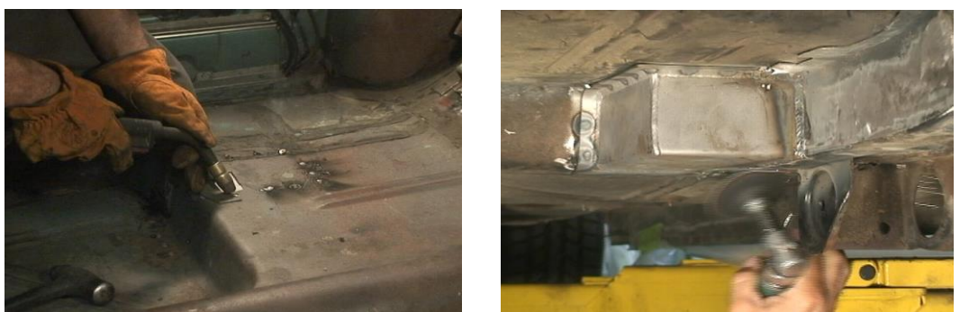
Torque Box Installation