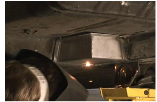
DSE-F501-133 (Rev 08/30/23)