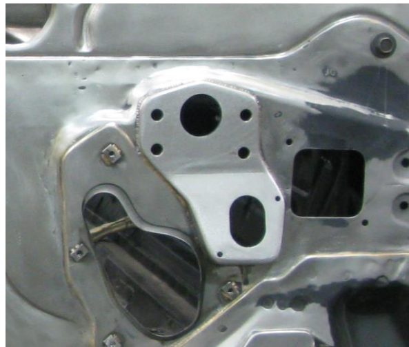
Figure 2 - Installed Bracket (1967-69 shown)