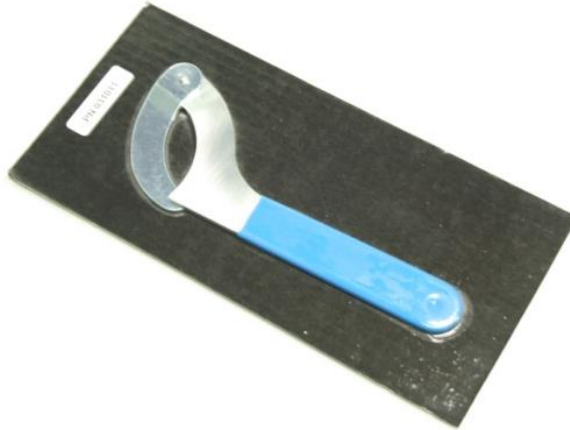
Figure 4 - Spanner Wrench