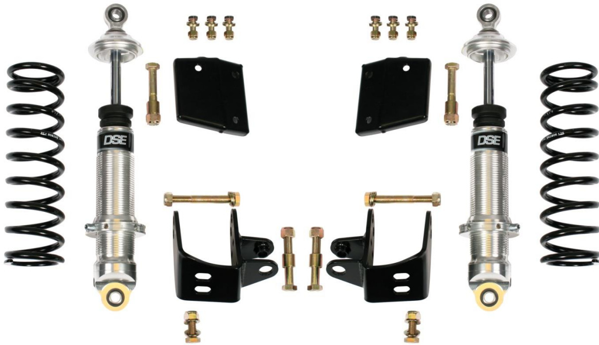
P/N: 042420DS Shown

The Detroit Speed G-body Rear Coilover Conversion Kit is a terrific way to upgrade the rear suspension in your G-Body vehicle. The kit replaces the existing coil spring and shock combination with a “Detroit Tuned” coilover shock and spring package. The kit is a complete bolt-on package and includes all necessary parts to complete the conversion.