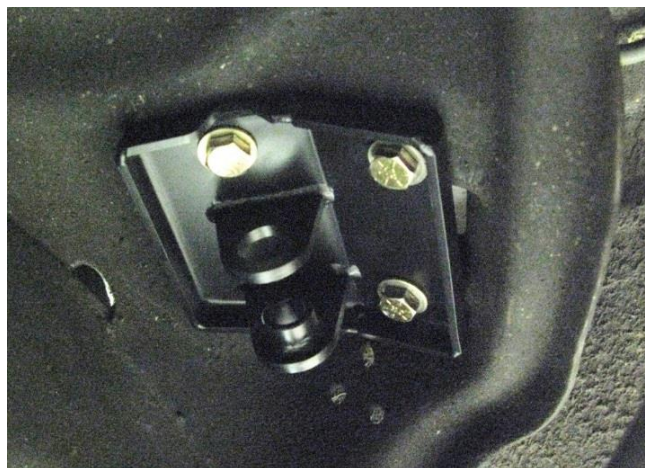
Figure 2 - Installed Upper Coilover Bracket