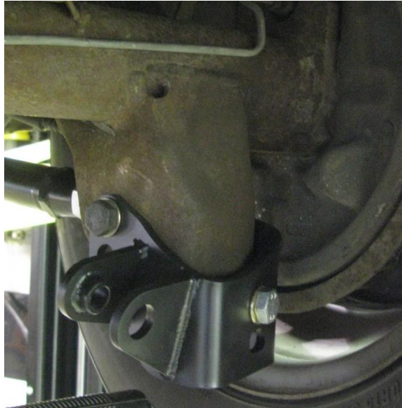
Figure 1 - Installed Lower Coilover Bracket (P/N: 042420DS Shown)