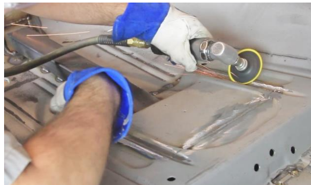
Figure 19 - Grind Welds Smooth