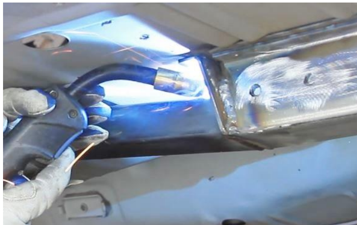
Figure 16 - Weld Front of Connector