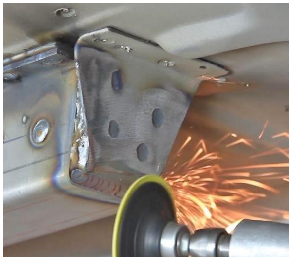
Figure 8 - Trim Frame Rail Doubler Closeout