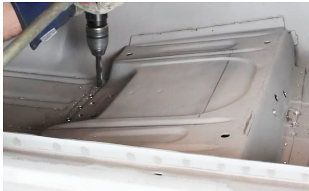
Figure 2 - Drill-Out Spot Welds