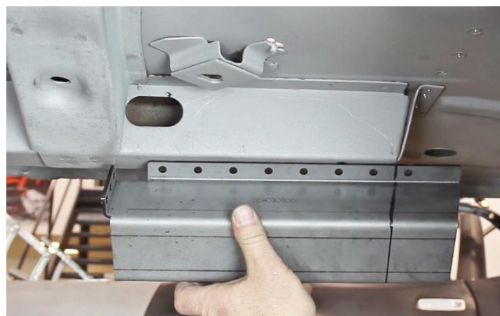
Figure 6 - Trim Frame Rail Doublers