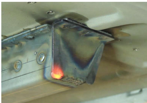
Figure 9 - Weld Closeout