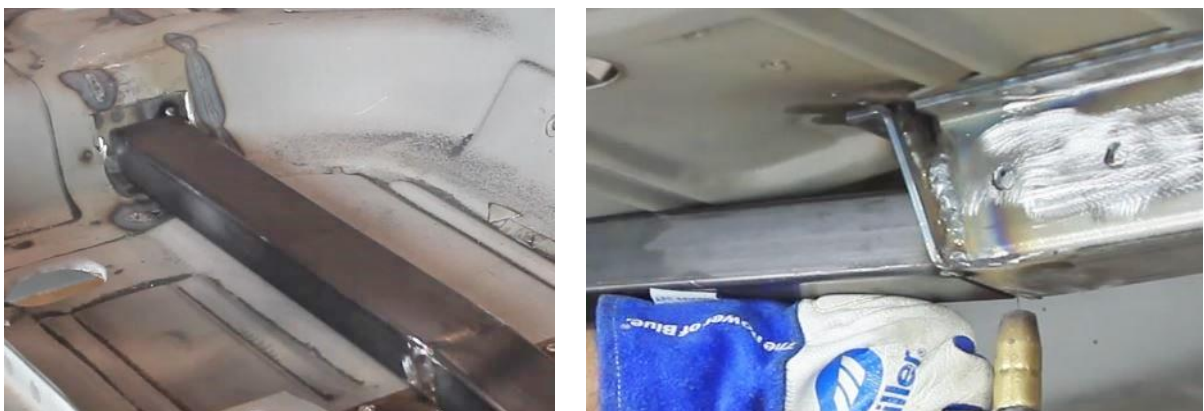
Figure 14 - Tack Weld Connector in Place