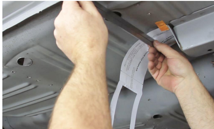
Figure 4 - Locate Floor Cut-Out Template