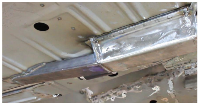
Figure 20 - Finished Installation