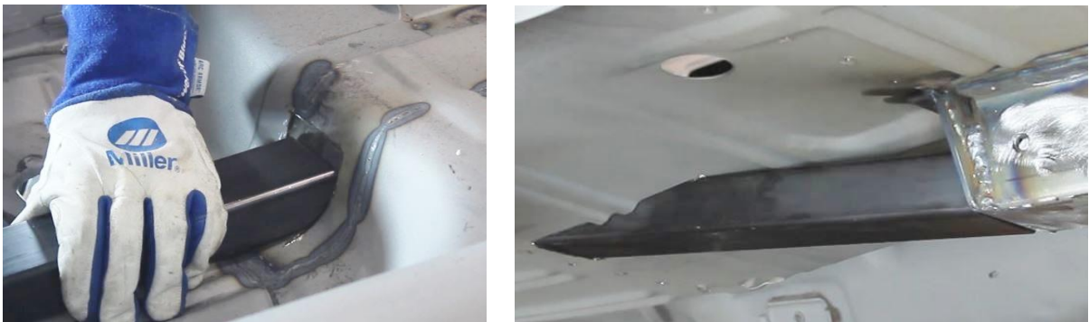
Figure 12 - Fit Subframe Connector