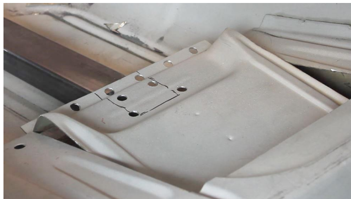
Figure 17 - Cut-Out Seat Riser