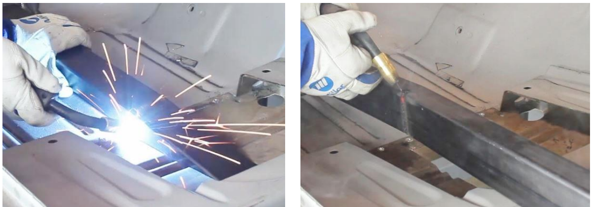
Figure 13 - Weld Adjustment Slot in Connector