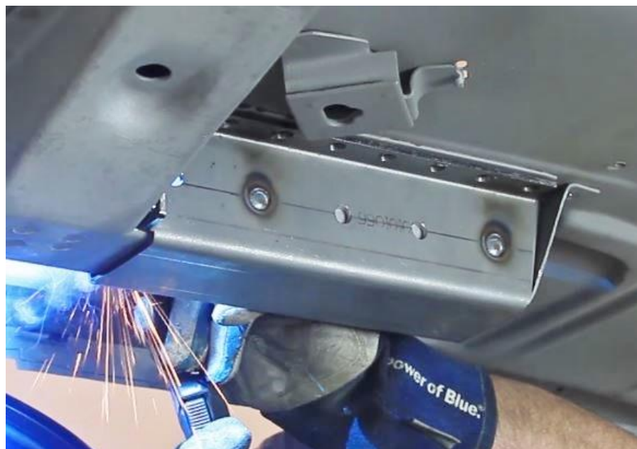
Figure 7 - Plug Weld Doublers