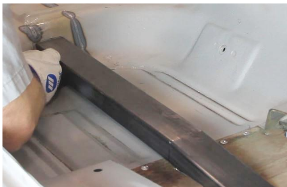
Figure 10 - Outline Connector

NOTE: If you are not installing the Detroit Speed QUADRALink or Leaf Spring Mini-Tub Kit, you will need the Detroit Speed Torque Box Kit [P/N: 010109]. At this point you will need to install the torque boxes.