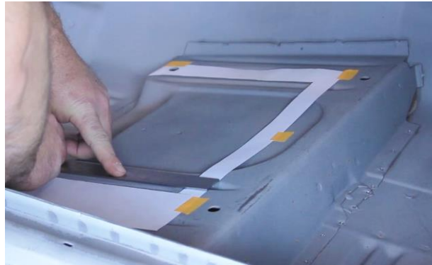
Figure 1 - Trace Template on Seat Riser