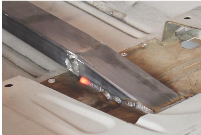
Figure 15 - Weld Connector Underneath Seat Riser