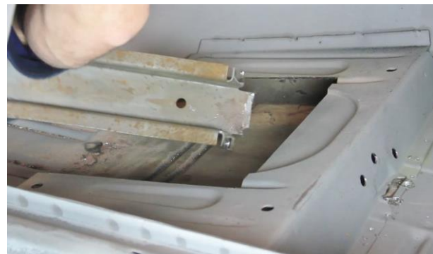
Figure 3 - Remove Seat Riser & Support Bracket