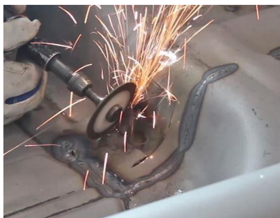
Figure 11 - Cut Floor Pan