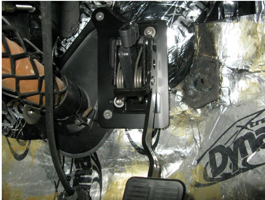
Figure 2 - Installation on a 1967-68 Camaro

If you have any questions before or during the installation of this product, please contact Detroit Speed at tech@detroitsspeed.com or 704.662.3272