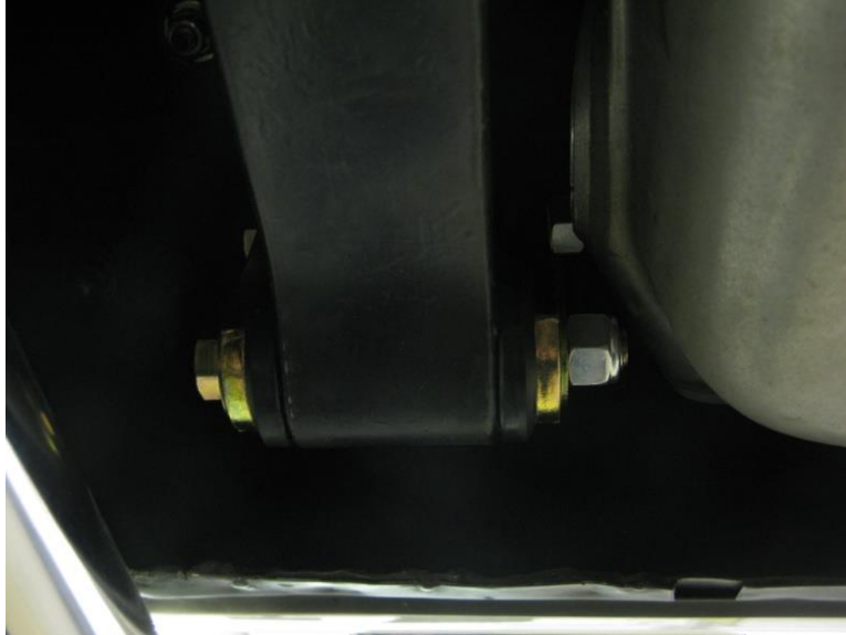
Figure 2 - Rear Leaf Spring Shackles Installed