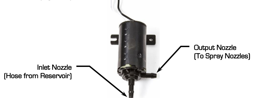
Figure 3 - Connect Hoses to Washer Pump

6. Connect the hose going to the windshield spray nozzles to the output nozzle of the washer pump. Use the provided hose to go between the inlet nozzle of the pump and the reservoir (Figure 3).