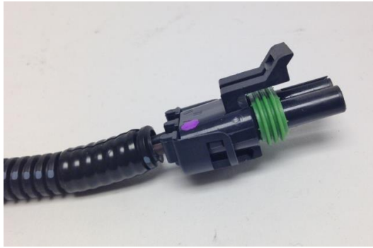
Figure 1 – Washer Pump Connection