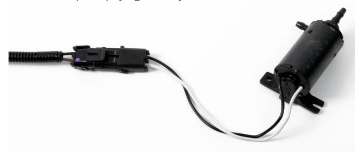
Figure 4 – Connect the Weather pack Connectors

7. Connect the weather pack connector on the wiring harness to the weather pack connector on the washer pump (Figure 4).