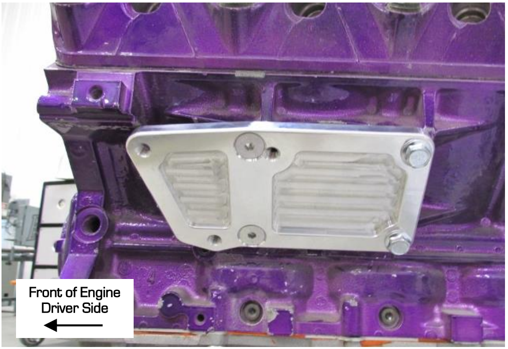
Figure 1 - Install Adapter Plate