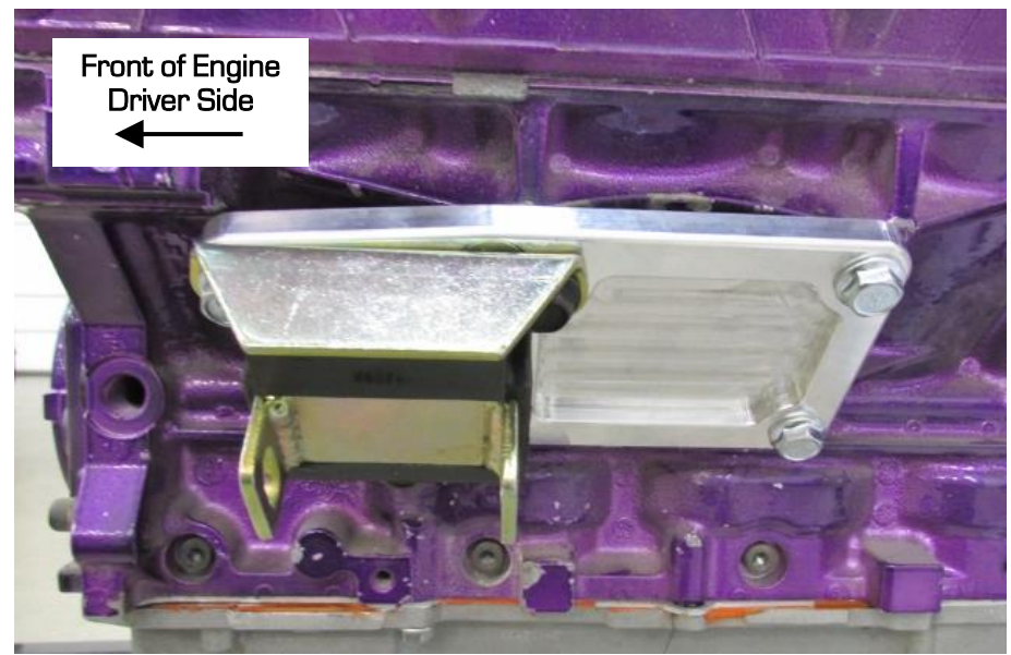
Figure 2 - Install Engine Mount

5. Once everything is positioned correctly on the engine, attach the engine to the frame using two 7/16"-14 x 3.75" L hex head bolts (#7). Use the provided flat washers (#9), lock washer (#10) and the hex nut (#8) to tighten everything in place. Once the engine is level, torque these bolts to 30 ft.-lbs. (Figure 3).