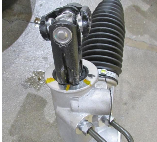
Figure 1 - Steering Rack Coupler