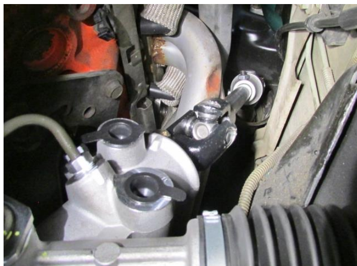
Figure 4 - Install U-Joint