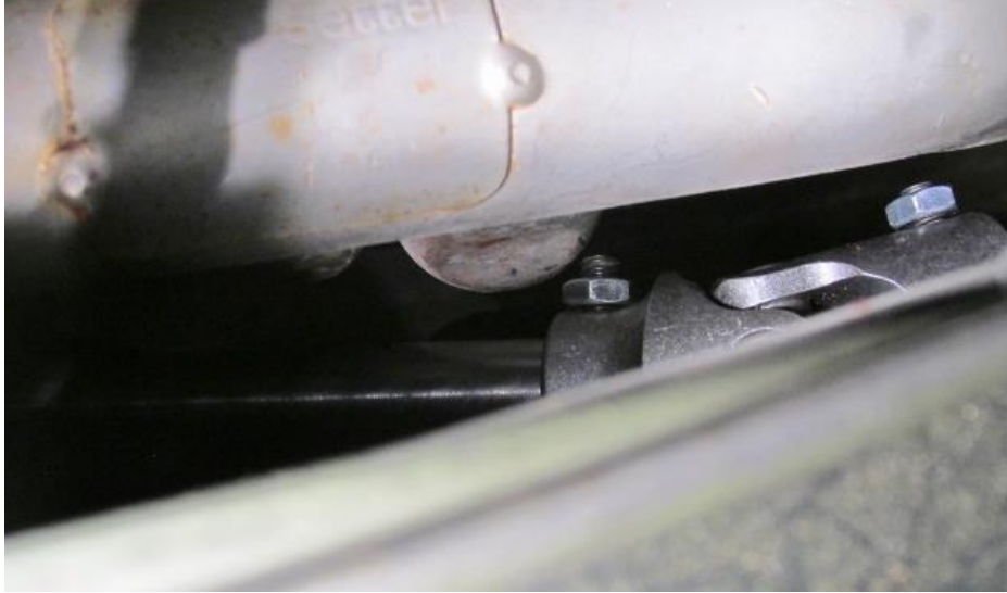
Figure 5 – Shorten Set Screws if Needed