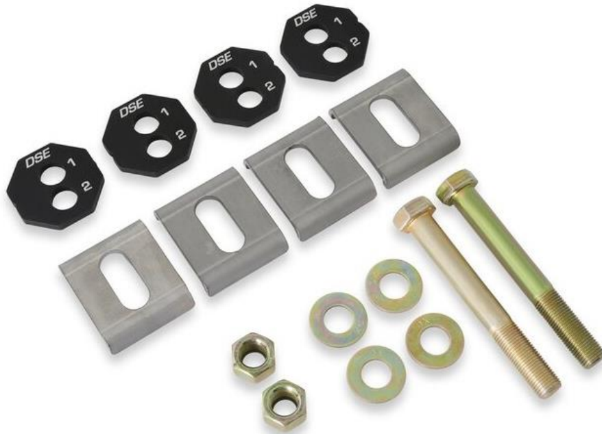
Figure 1 - PN: 031728DS Shown

The Detroit Speed Camber Eccentric Lockout Kit allows you to add alignment adjustment to the lower control arm on your 1964-66 Mustang. For the 1967-70 Mustang, DSE has improved the factory alignment hardware by replacing the round eccentric washer. The DSE octagon washer allows sixteen adjustment locations and eliminates any movement of alignment. Each shim is black anodized 6061 aluminum with laser etched hole locations.