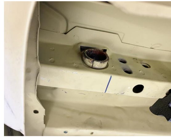
Figure 1 - Remove Shackles & Bushings