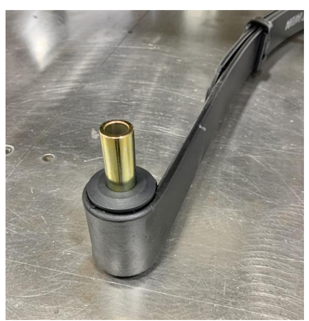
Figure 2 - Install Poly Bushings & Crush Sleeves

4. Once all the leaf spring and frame bushings are installed and crush sleeves are in place, install the front leaf spring into the vehicle using your factory hardware and tighten.