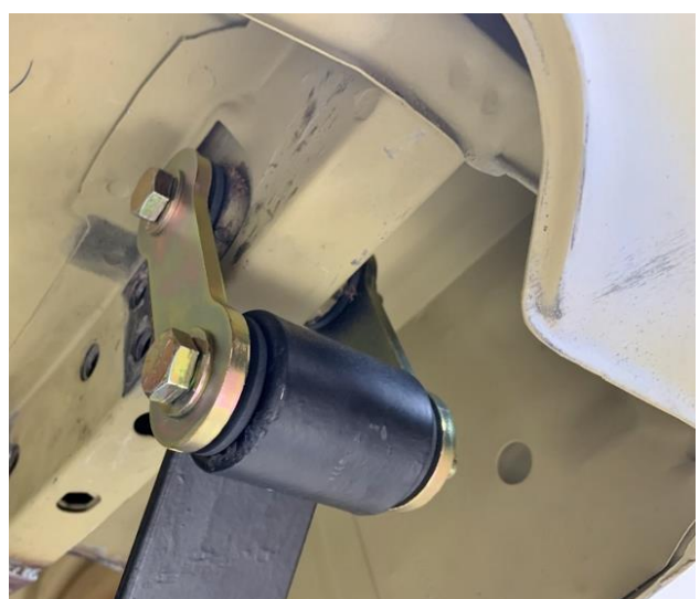
Figure 3 - Rear Leaf Spring Installed

7. Once the leaf springs are installed torque all 1/2"-20 hardware to 75 ft-lbs.