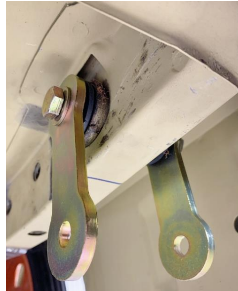
Figure 2 - Rear Leaf Spring Shackles Installed

6. Mount the leaf spring into the shackles using the provided 1/2"-20 hex head bolts, washers and Nylock nuts (Figure 3). Repeat this process for the opposite side of the vehicle.