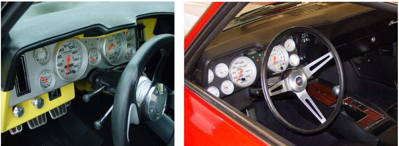
Figure 2 – Custom Gauge Layout

Two examples are shown as possible custom gauge layouts for the DSE dash inserts (Figure 2).