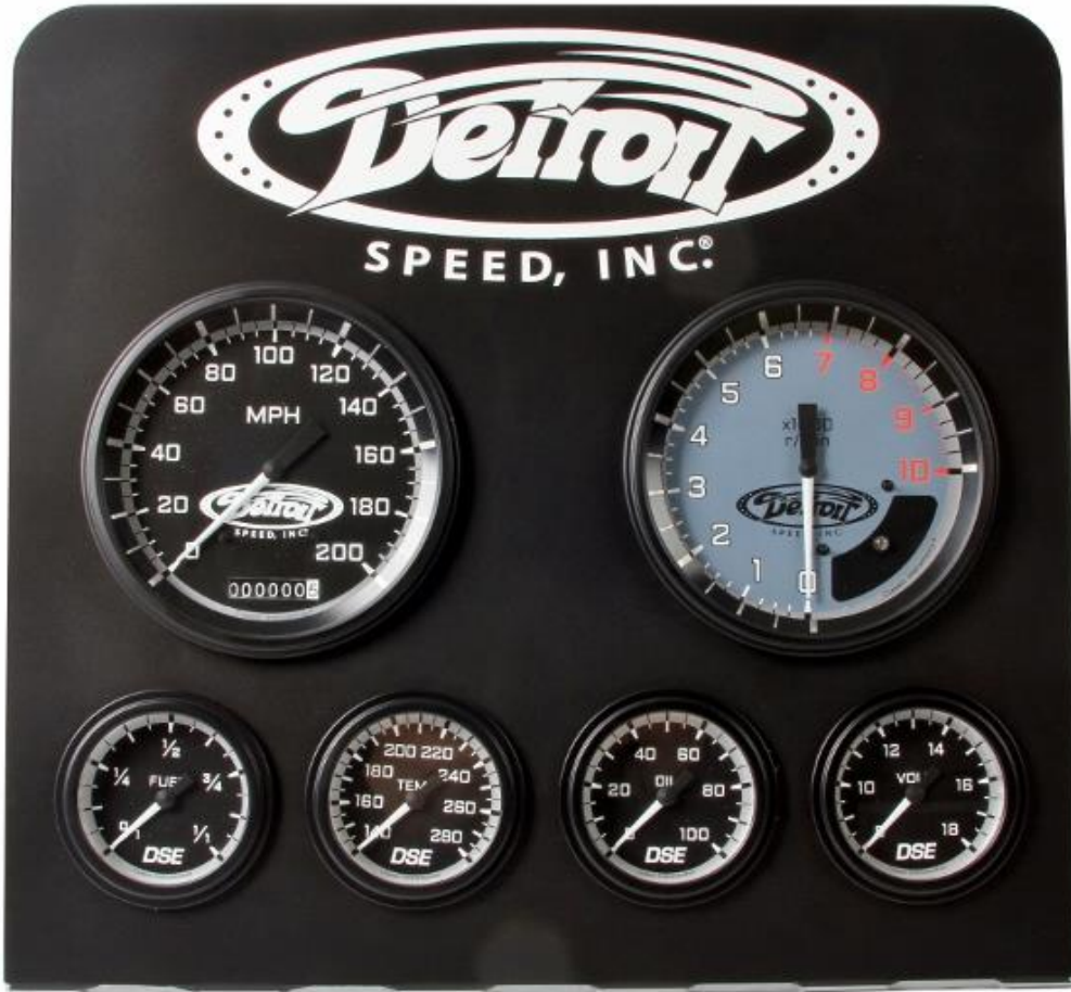
Figure 3 – Detroit Speed Gauges

Detroit Speed also offers a six gauge set by Classic Instruments for your steel dash insert (P/N: 120401 or 120402) available through DSE (Figure 3).