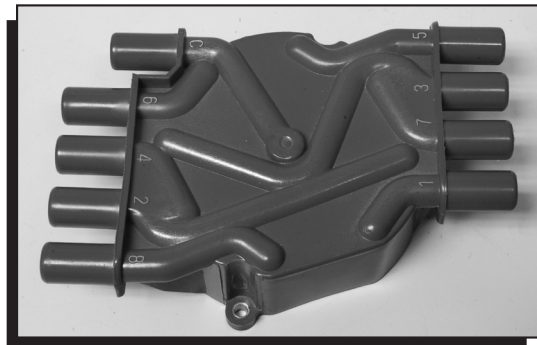
Figure 2 Distributor Cap.